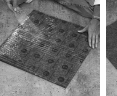
Remove peel-off backing and slide carpet tile into position on the floor